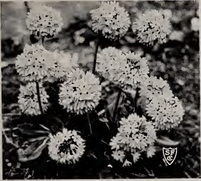
PRIMULA CASHMERIANA. Early spring flowering with large foliage from which arise stout stems bearing ball-like flower clusters of light purple color. 35c each; 3 for $1.00.